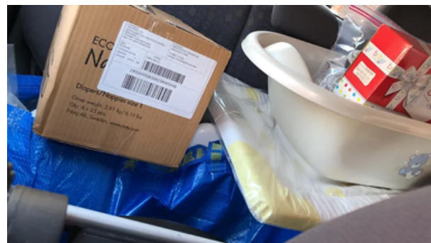
Delivering essential items - April 2020