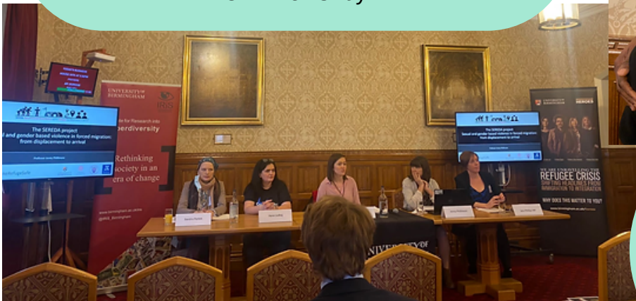
Over 20 women supported by Baobab participated in the SGVB SEREDA report by Birmingham University