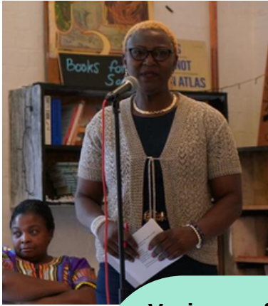
Voices from the frontline - book launch June 2021