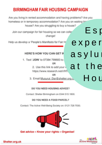
Espoir shared her experience of living in asylum accommodation at the Birmingham Fair Housing Campaign